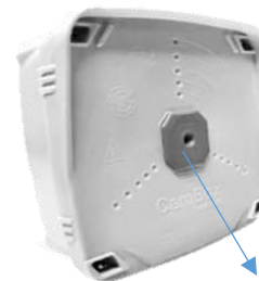
Flexible Plug Liquid Barrier